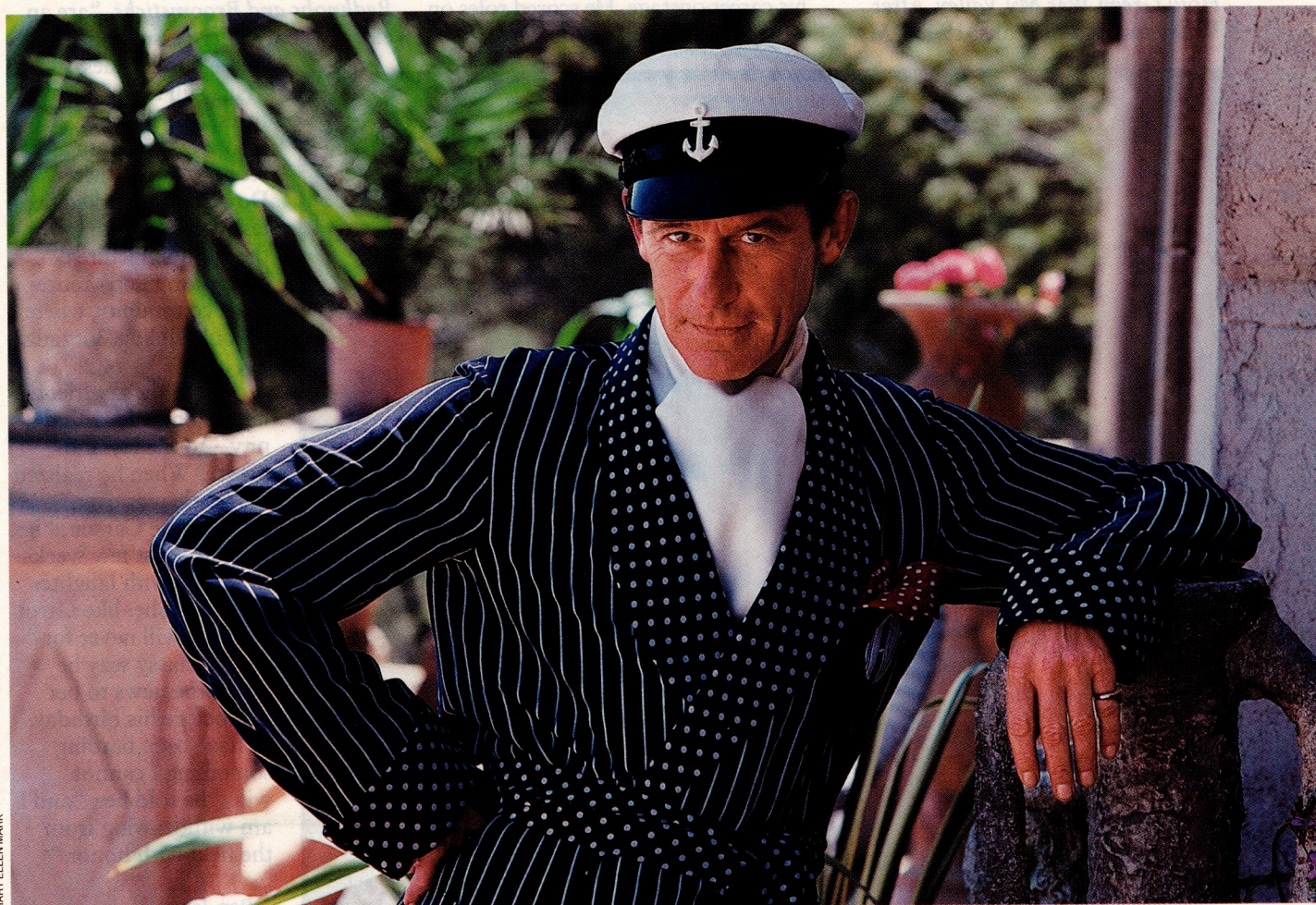
McDowall (on a movie set in Spain in 1981) "had this wonderful humor and twinkle in his eye all the time," says friend Angela Lansbury.

For McDowall, the narrative began at age 8, when the London native and son of a merchant seaman