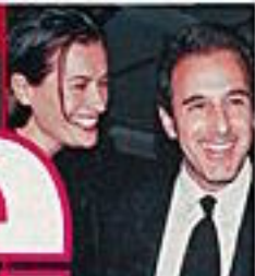
Today's Matt Lauer & Annette Bening