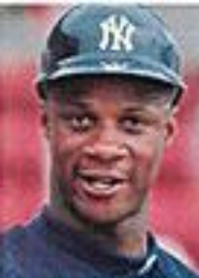
Darryl Strawberry's brave battle